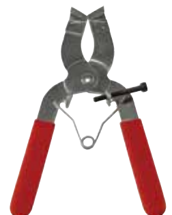
97F176 Adjustable piston ring installer tool.

Easy and safe piston ring installation without over-expanding the rings. Fits most common piston diameter. From 3/64" to 1/4" thick.