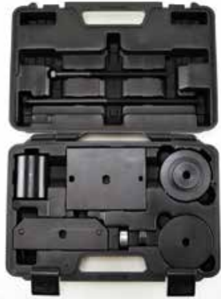
97F414 5 Speed main drive gear tool.