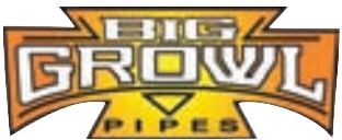
Big Growl® Long Rifles