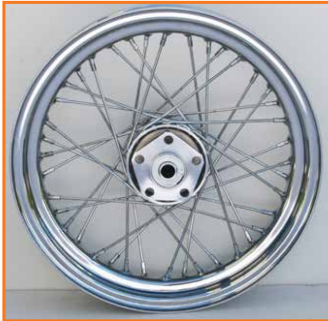
Wide Glide front, FL Dual Disc 73/83 36|305* 16"x 3.00" Tapered Bearing, 3/4" Axle