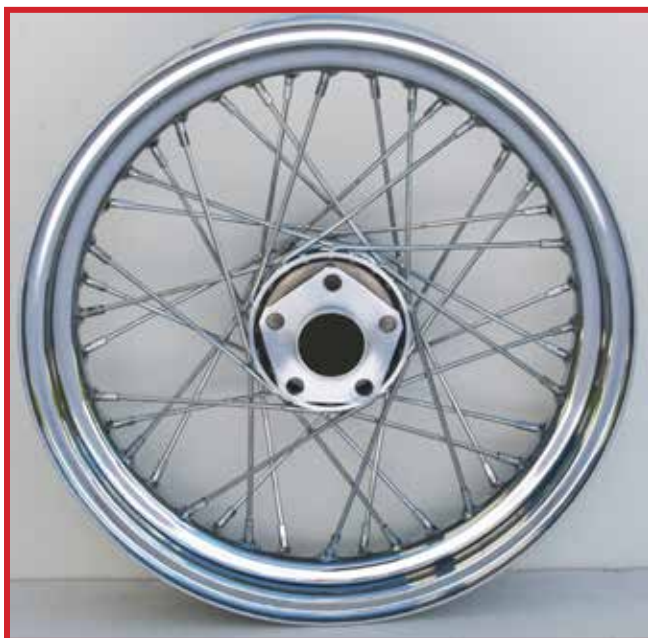
FL 67/72, Wide Glide front, FL 67/72 36-304* 16"x 3.00", w/o bearings, spacers or seals