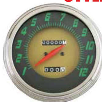
1950 MODEL STYLE NUMBERS