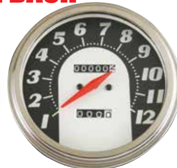
1960 MODEL STYLE NUMBERS

NOTE: The exact face colors & numbers may vary with availability from manufacturer. Ratio will be correct. 5/8 x 18 nut.