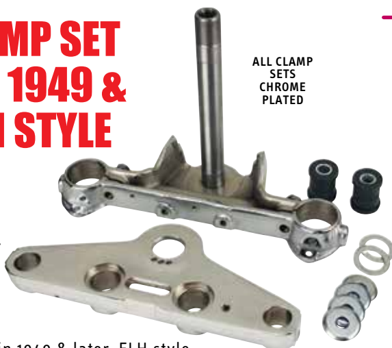
ALL CLAMP SETS CHROME PLATED

Fits fork tubes with O.D. 1.625". Top clamp has riser mount holes 3.5" center to center.