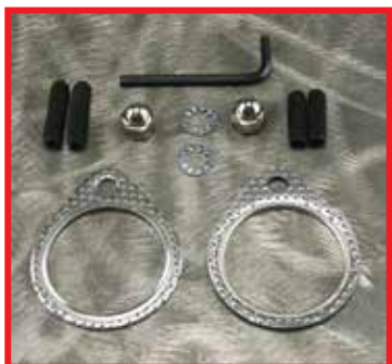
ACORN NUTS CHROME PLATED

64F369 Fishtail extension. 29" Long, no baffle. SOLD EACH