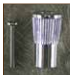
57-96 CHROME PLATED